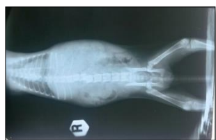
Figure 2. Dorso ventral Recumbency Radiograph