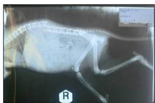
Figure 1. Lateral Recumbency Radiograph

Incised through subcutaneous fat and fascia to reach the thoracolumbal. Incise fascia to expose an underlying second layer of fat and the thoracolumbal musculature. Clear the musculature of the pedicle until the processes spinous exposed.