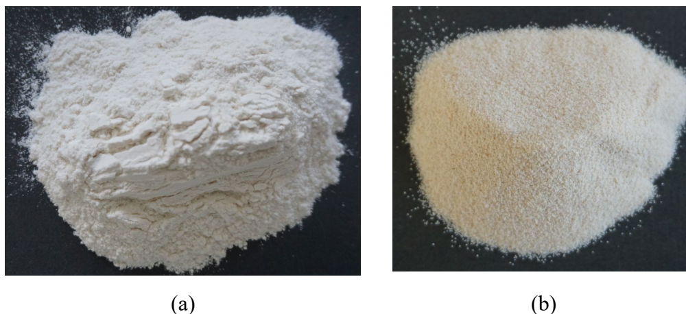
Figure 3. The colour of gembili flour from white-fleshed (a) and purplish-white-fleshed (b) tubers.

White-fleshed gembili produced higher flour yields than purplish-white-fleshed gembili, which is thought to be related to the weight of the tubers and chemical content, such as the carbohydrate content in the flour produced in this study (Table 2). According to Susila et al. (2023), white-fleshed gembili tubers ( Yawal Porei ) and purplish-white-fleshed gembili tubers ( Thai ) can have weights of 0.9 kg and 2 kg, respectively. Which certainly affects the amount of skin wasted during the peeling process. In addition, the carbohydrate content of white-fleshed gembili tubers is thought to be higher than that of white-purplish gembili tubers, which can be seen from the presence of starch sediment during the soaking process of white-fleshed gembili tuber slices, which is thought to affect the yield produced (Rahman et al., 2015; Sabda et al., 2019). The yield results in this study are still lower than the yield in some previous studies, as reported by Jamaludin and Andari, (2023) 14.39% - 29.88% and Simatupang et al. (2021) 14.46% - 23.57%.