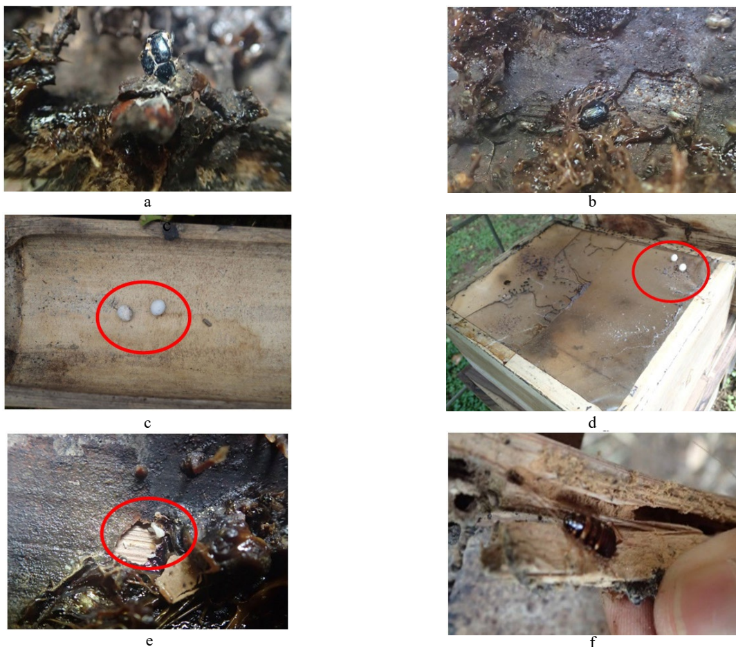
Figure 4. Natural enemies attacked the stingless bee colonies in bamboo: (a) Platysoma leonti (mummified), (b) P. leonti stuck in sticky cerumen, (c) eggs of lizard on bamboo colony, (d) eggs of lizard on plastic cover of wooden box, (e) and larva of termites at bamboo, (f) and the cockroach