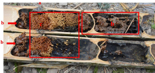
Figure 2. Structure and composition of the cavity-nesting of stingless bees in bamboo: (a) the nest entrance, (b) storage pots, (c) brood cells

inside, consist of nest entrance, cerumen, storage pots (honey and pollen), brood cells, and storage pots. Generally, the structure and composition of stingless bee nests consist of nest entrance, inner tunnel, brood cells, storage pots (honey and pollen), and batumen layers (Sakagami et al. 1983).